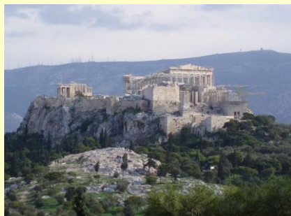
The Areopagus hill where St. Paul first talked about Christianity in Athens and Acropolis in the background

The Ecumenical Encounter as a means of dialogue between Christians of different denominations was born during the World Scout Jamboree in England, UK in 2007. Since World Scouting already accepted the need to have an inter-religious dialogue, it was logical to establish a dialogue between Christian denominations as well. The 1 st Ecumenical Encounter was organized by ICCS, in Canterbury, England, in 2008. There were in total 36 participants representing five different Christian denominations.