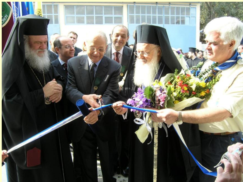
Archbishop of Athens & all Greece Ieronymos II, Treasurer of the Committee Board, two benefactors of the Scout center, Ecumenical Patriarch Bartholomew and Chief Commissioner, on the inauguration.

Deputy Secretary General. The Patriarch mentioned the interest of Scouts for Environment, and congratulated them for their efforts. He then unveiled a commemorative plaque of the event and signed on it with a wish for every Scout. Afterwards the Patriarch decorated the Scout Order of the Silver Pheonix, the highest distinction of Scouts of Greece.