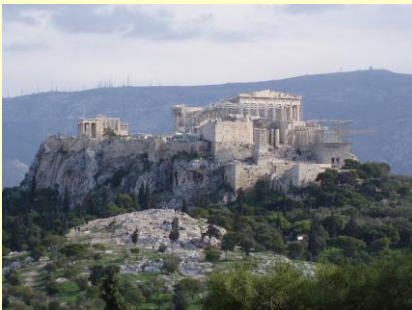
The Areopagus hill where St. Paul first talked about Christianity in Athens and Acropolis in the background

The Ecumenical Encounter as a means of dialogue between Christians of different denominations was born during the World Scout Jamboree in England, UK in 2007. Since World Scouting already accepted the need to have an inter-religious dialogue, it was logical to establish a dialogue between Christian denominations as well. The 1 st Ecumenical Encounter was organized by ICCS, in Canterbury, England, in 2008. There were in total 36 participants representing five different Christian denominations.