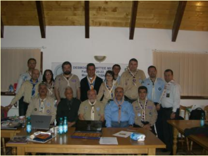
DESMOS Committee meeting, Tismana Monastery, February 2009

“New DESMOS committee from February 2009. Page 3 of 4”