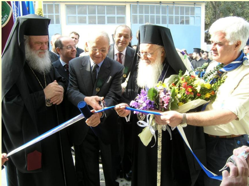
Archbishop of Athens & all Greece Ieronymos II, Treasurer of the Committee Board, two benefactors of the Scout center, Ecumenical Patriarch Bartholomew and Chief Commissioner, on the inauguration.

Deputy Secretary General. The Patriarch mentioned the interest of Scouts for Environment, and congratulated them for their efforts. He then unveiled a commemorative plaque of the event and signed on it with a wish for every Scout. Afterwards the Patriarch decorated the Scout Order of the Silver Pheonix, the highest distinction of Scouts of Greece.