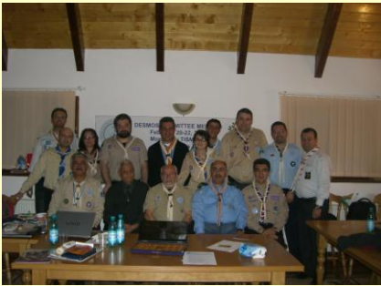
DESMOS Committee meeting, Tismana Monastery, February 2009

“New DESMOS committee from February 2009. Page 3 of 4”