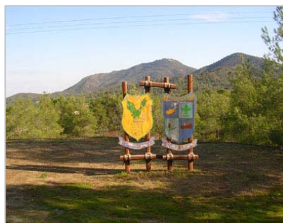
Visit to the Church and religious exhibition - Kornos Scout Centre

DESMOS COMMITTEE MEMBERS ARE GRATEFUL TO THE CYPRUS SCOUT ASSOCIATION FOR WARM HOSPITALITY AND WONDERFUL TIME IN CYPRUS!