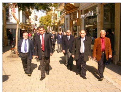
Visit to Nicosia - participation at the Liturgy in the Church of St. Demetrios and walking the streets of Nicosia