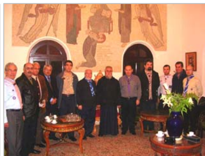
Visit to the Archeological site and the Monastery of St. Neophytos in Pafos district