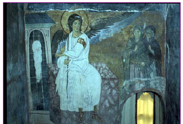
The famous fresco "White Angel"