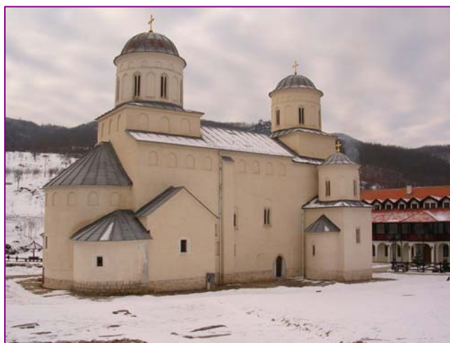
Monastery Mileseva Serbia