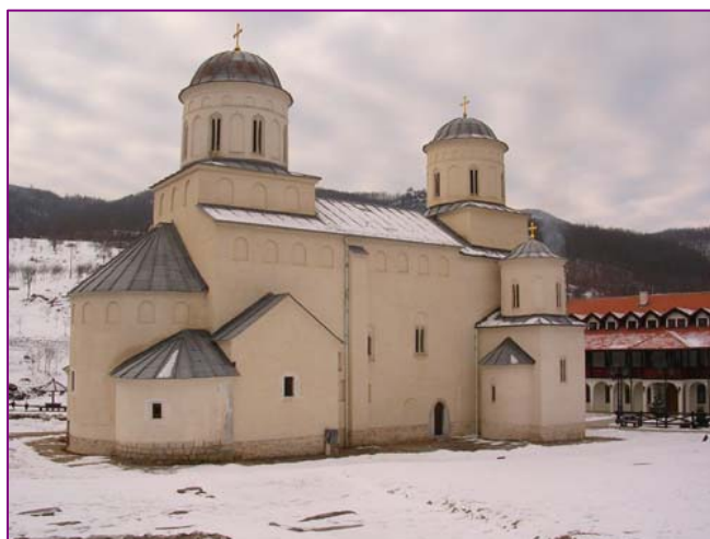
Monastery Mileseva Serbia